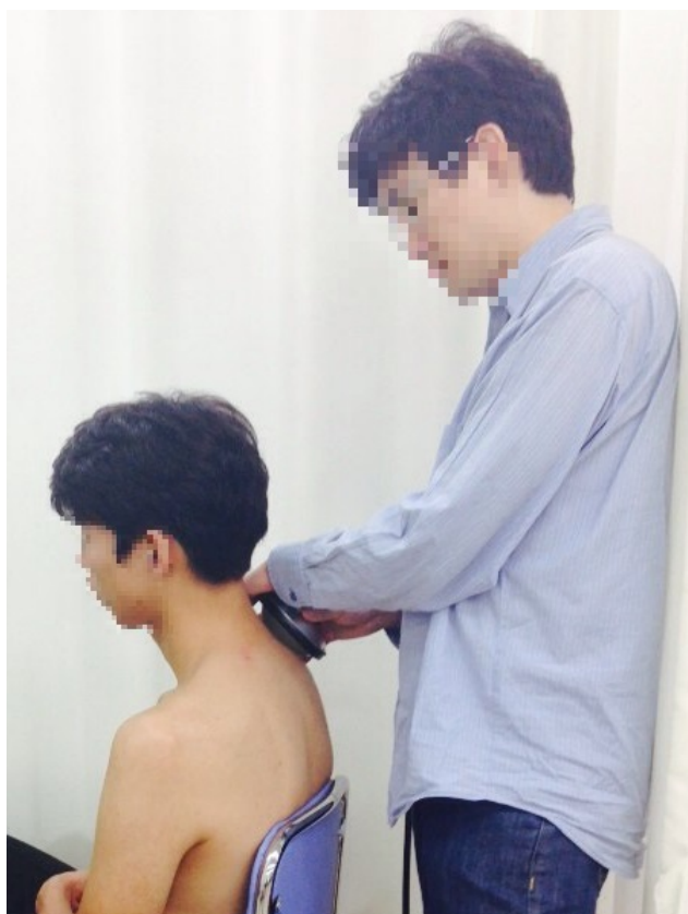
Figure 1. Extracorporeal shock wave therapy application.

number of shock wave was applied to anterior and posterior 500 pulses respectively, total 1,000 pulses received (Figure 1). Lastly, the PPT and VAS was measured again after treatment.