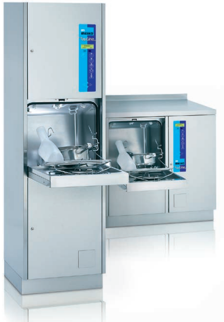
TopLine 20 floor model and TopLine 40 table top model with automatic door-opening (optional) and foot switch (optional).