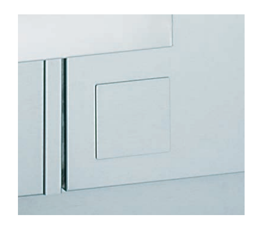
Opening and closing by using the foot switch (optional).